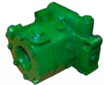
Hydraulic Pump 40/50 series 8 Pistons 23cc Low Cap