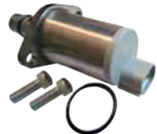
Valve John Deere 20's Common Rail High Pressure Pump