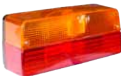
Baglygte incl pærer JD 6000