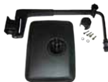
Spejlarms sæt JD 6000 800 kr