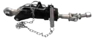
59089 Stabilisator Automatic 6010 s