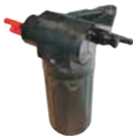
Fuel Lift Pump Electric 54 / 64