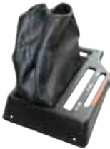
Gear Ford 7840 & Plastic Console