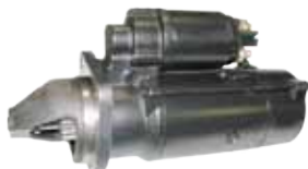
Starter 4200 Hi Speed 4.2KW