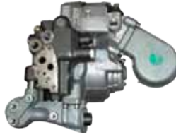
Hydraulic Pump 40 TS SLE Series