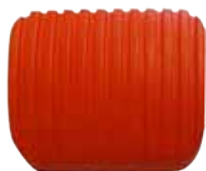
Fodgas Pedal TM TS TSA TL TLA T4000 T5000 T6000 T7000 M Series 60 Series