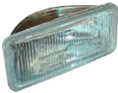
Alm halogen 10's / LED Version