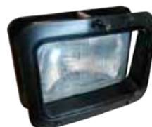
Forlygte TS Series