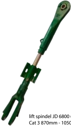
lift spindel JD 6800 6900 Cat 3 870mm - 1050mm