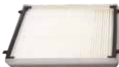
Indv kabine filter Filter John Deere 6220 - 6920 6230 - 6930 7430 7530 6105R - 6210R