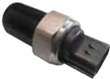
Sensor John Deere 20s 30s Fuel Rail Pressure Common Rail