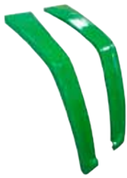
Bagskærmsæt 6000 - 6900 6010 - 6910 par Metal