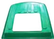
- SG2 tag