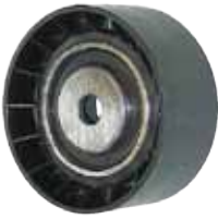
stramme rulle 61/62/63/64/65/66/68/6900