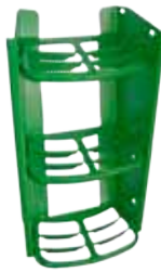
Trappe h-v side JD 6600 6800 6900 -(3 trin)