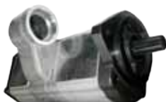
Hydraulic Pump 4200 4300 5300 Tandem