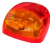
Baglygte JD 20 Series