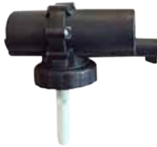
Pump Electric JD 6cyl 10/20s