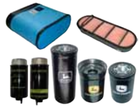
Filter Kit John Deere 6 Cyl / 20's Premium 2400 kr