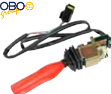
Vendegear håndtag Ford TLA TM TSA TS TL 60 Series M