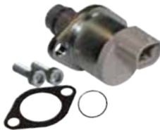
Solenoid John Deere 6130 6230 6330 6430 6630 6830 6930 6140M 6150M 6170M Diesel Stop