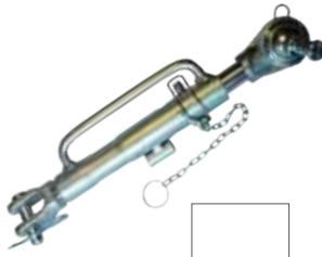
Stabilisator 6010-6920 800 kr