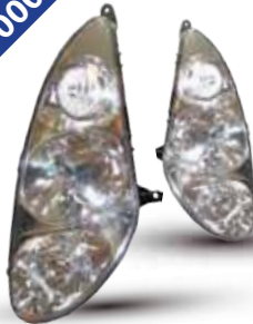
Forlygte h/v T7000 Series Right Hand