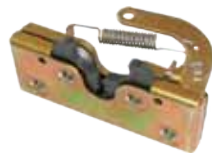
Lås fronthjelm Ford TS TM TSA 60