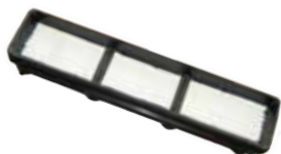
Kabine Filter JD 6000 6010 6020 6030 20 & 30 Series