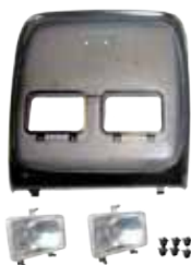
Grill & front incl lygter Kit 42 43 62 82