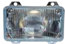
Forlygte JD 20 Series,