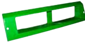
Lygteramme John Deere 10s Roof Lamp