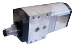
Hydraulic & Power Steering Pump 3000 6100