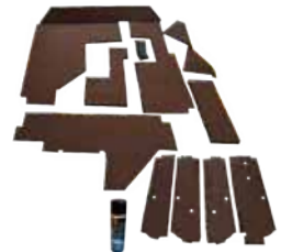
SG2 indtræk sæt bund/dørstolper incl lim 2500 kr /kun bund 2000kr