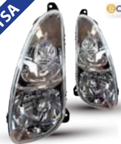
Forlygte h/v TS100A TSA T5 T6 T7 TVT TLA LEFT HAND SIDE - LEFT HAND DIP 1600 kr /stk