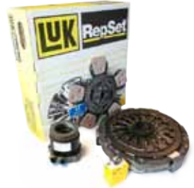
kobblings Kit 40 50 5 Paddle 330mm Split Torque Diaphragm 45 x 27 Spline