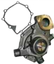
VandPumpe John Deere 6230 - 7530 Premium 4045 6068 Tier3 Engines