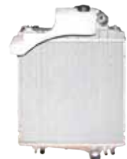
Køler JD 6 Cylinder 20 Series