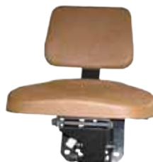
Passager sæde John Deere 6000's