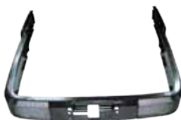
Front Grill TS Series nederst