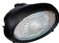
Arbejdslygte 52s 53s 54s 64s 71s 74s 84s