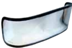
Glas til lygte front John Deere 30s Premium 725 kr