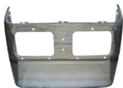
Front Grill TS Series