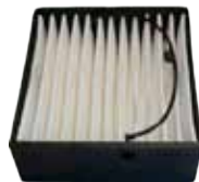
Pre Fuel Filter 54s 64s 74s Micron 700 800 900