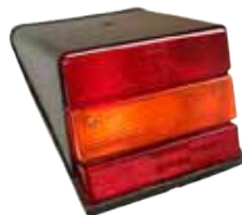
Baglygte Ford 40's White Roof Model