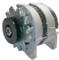
generator 300 12V 70amp