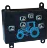
Control Panel New Holland T6 T6000 T7 T7000 Series