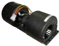
Blæsemotor Ford TS T6 T7 Maxxum 100 110 115 120 130 140 MXU 100 110 115 125 130 135