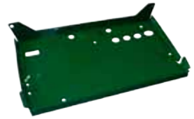
Batteri holder John Deere 6510 6610 6800 6900 osv