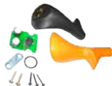
Gear håndtag JD 6010 6020