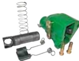
Komplet låsehus hitch